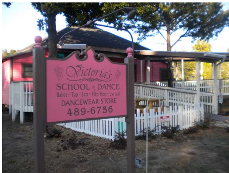
2010 also marks a new beginning in our new studio!

2010 is will be marked with fantastic events, including exciting adult